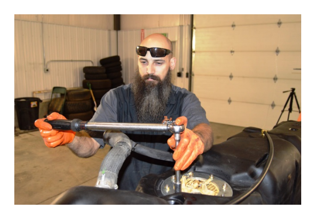
(Fig. 3) Place the sending unit into the TITAN tank, install the top flange, and tighten the nylon lock nuts to 20 ft. lbs using a "star" pattern using a torque wrench.