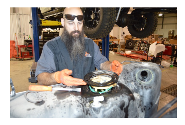
(Fig. 2) Loosen the hold-down ring on the OEM tank by turning counter-clockwise. Note where the connections on your vehicle's sending unit are "clocked" and install so they are located in the same position in the new tank.