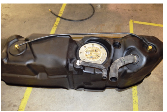
(Fig. 5) Photo shows the fill and main vent hoses transferred and installed on new TITAN tank. Note the 5/16" hose between the two rollover valves. The small line from the vehicle's fill spout will attach to the tee in this line. The tab on the sending unit lines up with the "TAB LOCATOR" marks on the tank body.

Attach the inboard sides of the straps. Tighten the bolt and bracket to factory specifications. Tap straps with a mallet, if needed, to form them against the bottom of the tank.