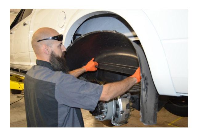
(Fig. 1) Some vehicles may require the removal of the fender liner and perhaps the left rear wheel so as to facilitate access to the tank fill and vent hoses.

Remove OEM tank plastic shield or shell (if applicable) from vehicle. Most vehicles may require the removal of the left rear fender liner and even the wheel to facilitate access to the tank fill and vent hoses (See Fig. 1).