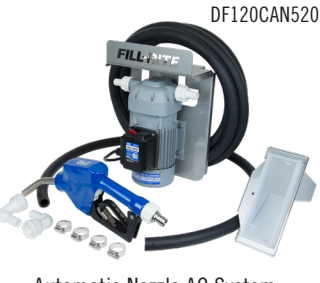
Automatic Nozzle AC System