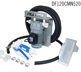
Manual Nozzle AC System